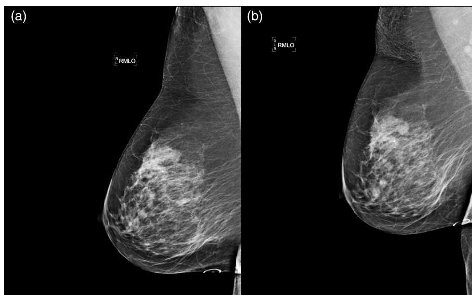
Fig. 1 Example of a practice case used in the study. There is a mass in the present exam. Note the misalignment between cases: (a) RML0 past and (b) RML0 present.

in screening mammography with an enriched sample of cancer. Each radiologist read 12 studies: 2 practice and 10 experimental. Each full-field digital mammography study included medial lateral oblique and craniocaudal views of both breasts. Each study included two cases: past and present. Participants were instructed to inspect each case as they would in practice. They were instructed to complete the caseload as quickly as possible without sacrificing accuracy. Once they had reached a